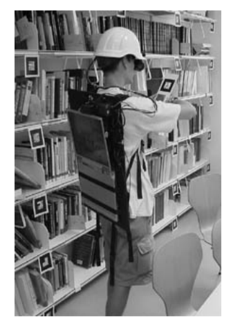
Figure 1. A user at work with the ARLib setup.

Next, text can be input by using either a virtual keyboard or a graffiti pad. The virtual keyboard provides a trusty means of input for the user not acommodated to grafitti input (as on a PDA), whereas experienced users will find the grafitti pad handier (see Figure 2.c). The input type can be toggled at any time.