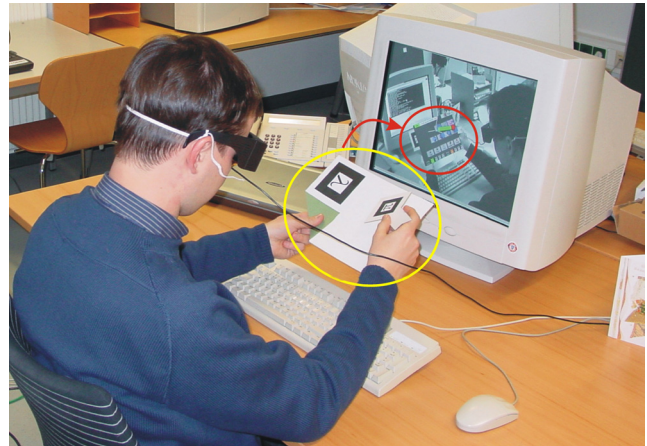
Figure 3: A user working with our desktop VR system. A FireWire camera (out of view) is used for optical tracking of the hand held props which are equipped with markers (see yellow ellipse). The image of the camera is used as a video background. Stereoscopic images are displayed on the monitor which give the user who wears shutter glasses the impression of working in 3D space. The virtual images of pen and PIP can be seen on the monitor (red ellipse) as an overlay over the video image.

Distributed hybrid classroom: Just like the hybrid AR classroom, this setup may use personal HMDs for realizing AR for the teacher and selected students. However, the students are all equipped with personal workstations displaying desktop VR watching the construction process on their screen. We built a desktop VR system using a FireWire camera for optical tracking and a standard consumer graphics card with shutter classes to get stereo rendering with optically tracked 6DOF input devices at a very low price (see Figure 3). The advantage of this scenario lies in the relatively low price for a personalized semi-immersive display: Students can choose individual viewpoints, maybe even manipulate local copies of the constructed object. However, a teacher can also choose a guided mode, e. g., by locking the students' views to the teacher's viewpoint.