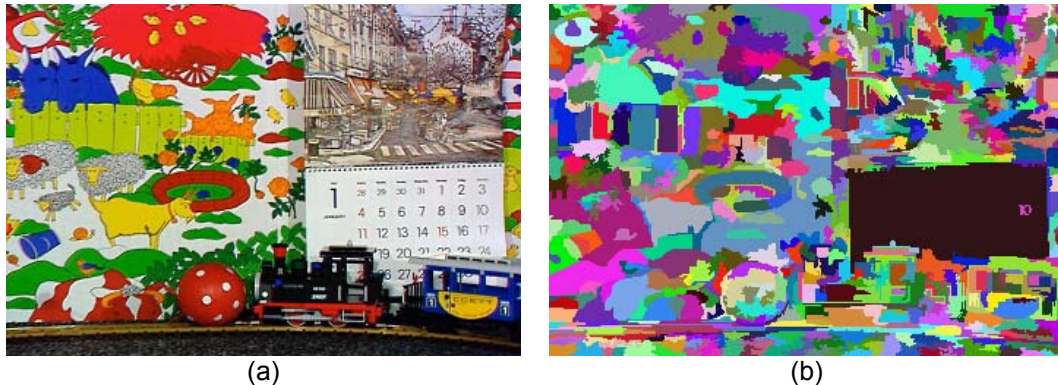
Fig. 1. Colour segmentation. (a) Reference image. (b) Segmented image. Pixels of the same colour belong to the same segment.

with V_x and V_y being the x- and y-components of the flow vector at image coordinates x and y and the a 's denoting the six parameters of the model. We compute a set of correspondences using the KLT feature tracker [8] and derive each segment's affine parameters by least squared error fitting to all correspondences found inside this segment. A robust version of the method of least squared errors is employed to reduce the sensitivity to outliers.