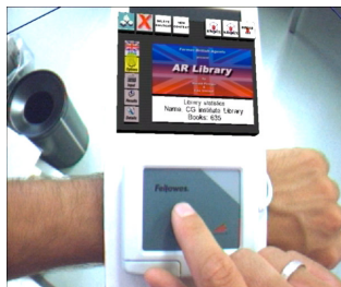
Figure 4. Touch panel with augmented user interface.

The touch panel is mounted to the wrist with an elastic band, and also has a marker attached. While the graphical overlay of the panel is only presented when it is in the user's field of view, the panel operation itself does not rely on the tracking of the panel marker, and can be done while looking at something else (see Fig. 4).