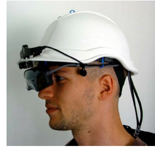
Figure 1. The helmet equipped with a miniature Firewire camera for optical tracking and an inertial sensor.

– the gloves / wrist pad devices as well as any other markers used to implement for example a card-based tangible interface. This leaves a lot of freedom in the application design.