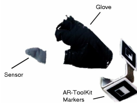
Figure 3. Individual parts of the Glove

To make the handling and maintenance easier, the gloves are built modular (see Fig. 3). This means that we use detachable markers and cables. While we found that markers are rarely removed, it is convenient to put on the disconnected glove and plug in the cable later. For this reason a small light weight lockable plug system has been chosen for the glove. It is important that the plug can be fixed so that it won't disconnect by accident.