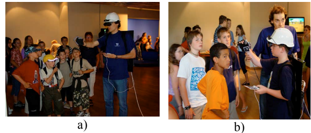
Figure 5. a) Demonstration of the mobile augmented reality system at a local science fair. b) A Participant is introduced to the use of the mobile setup .

Some experimental work went into making the whole setup durable, so it can sustain everyday work in the lab, and demonstrations to the public. This means in particular that the device can be put on and off many times. We found that particular care must be taken of durable cable mounting. We successfully verified our implementation in a "stress test" at a public science fair with 1500 participants, and found it durable and easy to use (see Fig. 5). During this test, we found that many users prefer to hold the touch pad in their hand. While the glove handling itself seems very intuitive to the users.